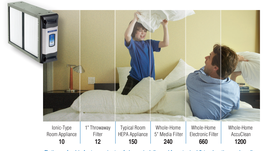
Ratings of cubic feet per minute of clean air delivered for a typical 3-ton heating and cooling system: the higher the value, the more effective the air cleaner.

Want 99.98% clean air? Then choose the home air filtration system that gives 110% – American Standard's revolutionary AccuClean.™ By removing up to 99.98% of unwanted allergens down to .1 micron from the filtered air, AccuClean is 100 times more effective than a standard 1" throwaway filter. Simply put, AccuClean works harder, so you and your family can breath easier.